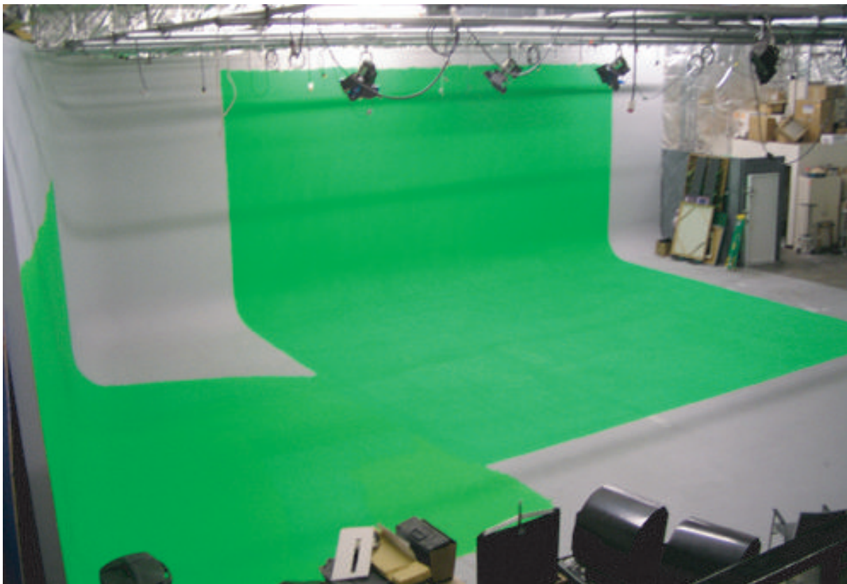
LMA Productions Stage